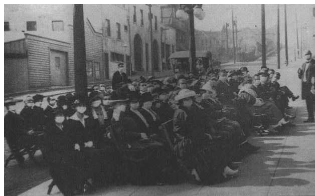
Figure 2. Sunday church services in San Francisco, 1918–1919

Sunday church services were often held outdoors during the 1918–1919 influenza pandemic, as shown here in San Francisco.