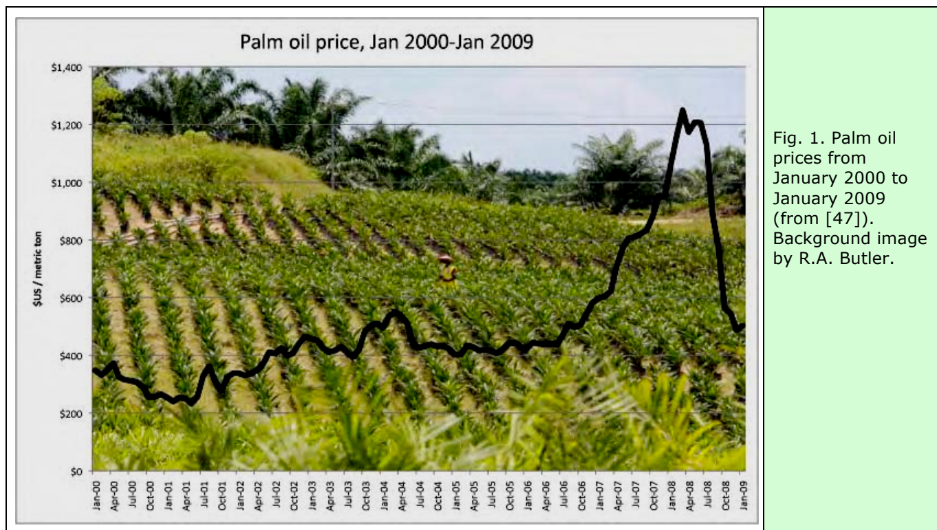
Fig. 1. Palm oil prices from January 2000 to January 2009 (from [47]).

Yet few realize that oil palm could soon drive similar forest loss in Amazonia, the world's largest expanse of tropical forest. Here we briefly describe the confluence of factors that could promote a sharp increase in oil palm agriculture in the region. Although the crop is being established in various parts of Latin America, we focus here on Brazil, where geographical, political, and corporate forces appear particularly aligned to pursue the aggressive expansion of an oil palm industry. We argue that, contrary to prevailing public discourse in Brazil, oil palm expansion would constitute a serious threat to Amazonian ecosystems and their associated biodiversity.