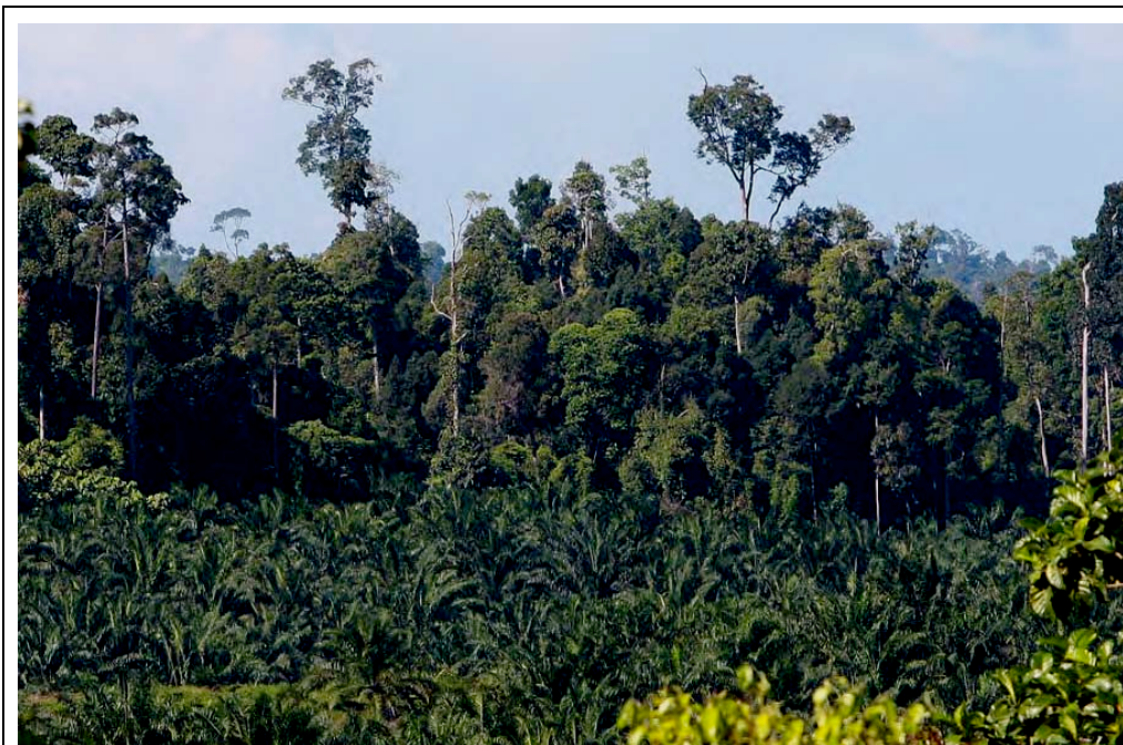
Fig. 4. Oil palm plantation adjacent to tropical forest in Sabah, Malaysia.