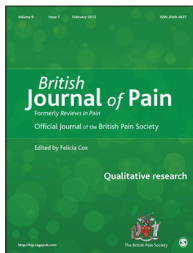
British Journal of Pain